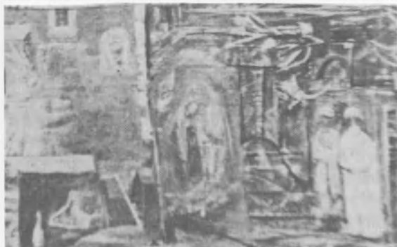
Fig. 10. Detail of figure 9

'Abdu'l-Bahá and other important figures in the early history of the Bahá'í Faith (figs. 10 and 11).