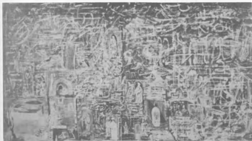
Fig. 9. MARK TOBEY. The New Day . 1945(?). Tempera, 12 \frac{3}{8} × 23 \frac{1}{8} ".

This vision of a human race lost in confusion and cut off from contact with a divine Reality seems to be the underlying theme of Tobey's City Paintings of the 1940s. The events of World War II must have seemed to Tobey but a sad confirmation of the plight of humanity. Throughout the 1940s, though, Tobey's visions of destruction alternate with those of salvation. The city is hell, but a hell that always contains the possibility of a transformation into heaven. In The New Day (fig. 9), probably painted in the same year as Broadway Melody , Tobey explores this theme. Now the city is the New Jerusalem, which has appeared on the earthly plane. The confining and divisive rooms at the bottom of the painting are dissolved in the new light of understanding. The appearance of this New Jerusalem, the City of God, marks the beginning of a New Age in which the higher consciousness of the human race will transform human existence into the Kingdom of God on Earth. The relationship of Tobey's Bahá'í beliefs to this vision is indicated by the inclusion of small turbaned figures, which are very reminiscent of photographs Tobey would have seen of