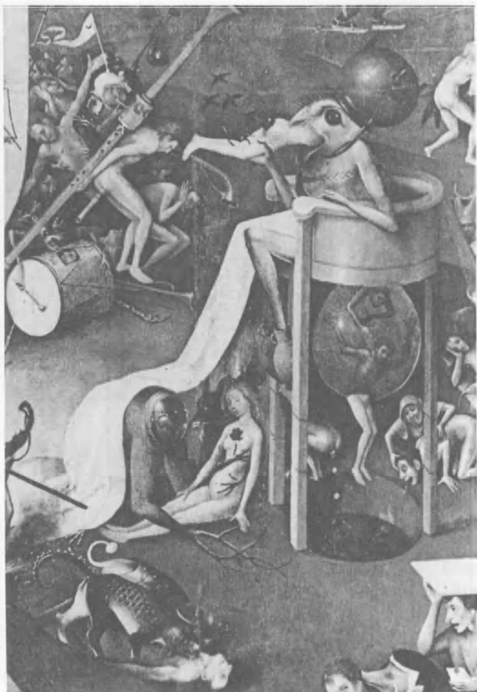
Fig. 7. Detail of figure 8

of medieval imagery reveals what must be understood as a modern interpretation of the Last Judgment. It is no surprise that Tobey's theme of the city as hell culminates during the 1940s when many of the world's great cities were being bombed into scenes of devastation far more terrible than any ever imagined by Bosch. In referring to Broadway, Tobey wrote: "Such a feeling of Hell, under a lacy design. . ." (Callahan Papers). Like Bosch, Tobey seems to have been overcome with visions of a heedless humanity careening toward a final and complete destruction.