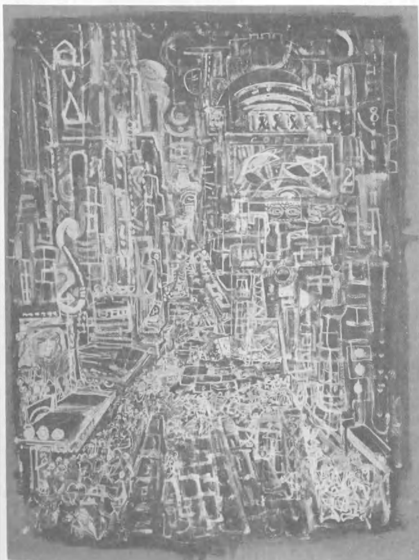
Fig. 1. MARK TOBEY. Broadway . 1935. Tempera on masonite board, 26 × 19¼". The Metropolitan Museum of Art, New York (Arthur H. Hearn Fund, 1942).

The artist's memories of that time were heightened by the great celebrations in the streets after the end of World War I. For Tobey, the New York of 1918 was "dynamic lights, brilliant parades and returning heroes" (Dahl, Art and Belief 4). Broadway became the centre of Tobey's recollections about this time, but it wasn't until some years later that he expressed his vivid memories in paint. The result was the brilliant and frenetic Broadway (fig. 1), painted in