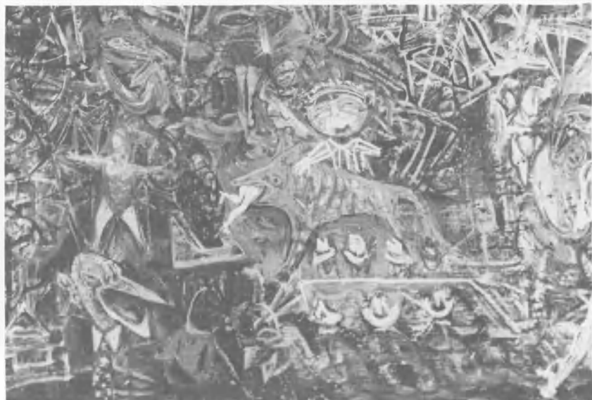
Fig. 6. Detail of figure 5

of Christ into Brussels or the terrifying urban landscapes of George Grosz. Tobey's inspiration surely derived from this northern European tradition and from the modern theme of the city as a place of loneliness and despair. But his strongest influence may have come from an earlier source, the sixteenth-century paintings of Hieronymus Bosch. In making this connection we may understand Tobey's vision of Broadway to be not one of celebration or a light-hearted tribute to the creative energies of Broadway but instead a depiction of hell—New York as a kind of modern-day Garden of Earthly Delights. In his paintings of Broadway in the 1940s, Tobey suggests the modern city as a theme with greater implications and symbolism to it than he had approached in previous treatments of the subject.