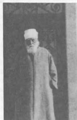
Fig. 11. Photograph of 'Abdu'l-Bahá, c.1920. Haifa, Israel

At the top of the composition, the structures of the city dissolve into slashes of paint that have been called Tobey's "white writing." The artist describes this writing as symbolizing "higher states of consciousness" (Tobey, "Mark Tobey Writes" 22). In the upper left section of The New Day , a shimmering translucent haloed woman appears. The following passage from the Bahá'í writings indicates she could be associated with the symbolic appearance of the New Jerusalem, which is to appear at the beginning of the New Age.