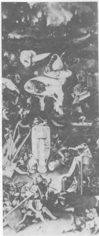
Fig. 8. HIERONYMOUS BOSCH. Hell , right wing of The Garden of Earthly Delights triptych. Oil on wood, 86\frac{5}{8} \times 38\frac{1}{4} ". Museo del Prado, Madrid

an adherent of the Bahá'í Faith about 1918. His involvement in this religion remained a lifelong commitment that had a major effect on the themes and iconography of his paintings. Tobey continually expressed his own belief in the importance of the Bahá'í Faith for his work: