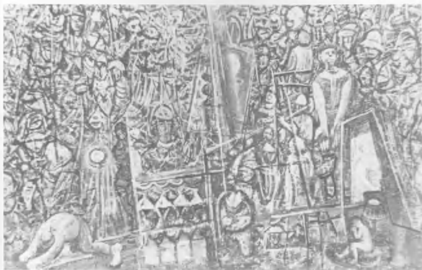
Fig. 4. Detail of figure 3

on her living room couch while a drunk stumbles beneath a street lamp (fig. 4). Haunted faces peer out of confining cubicles, and a large dominating woman hovers above. Crowds surge out into the streets. They do not wear the false masks of gaiety this time but stand crushed together in that forced intimacy of the modern city. The shop fronts and marquees define the perspective, and the reflected lights of the city taper off into the black night.