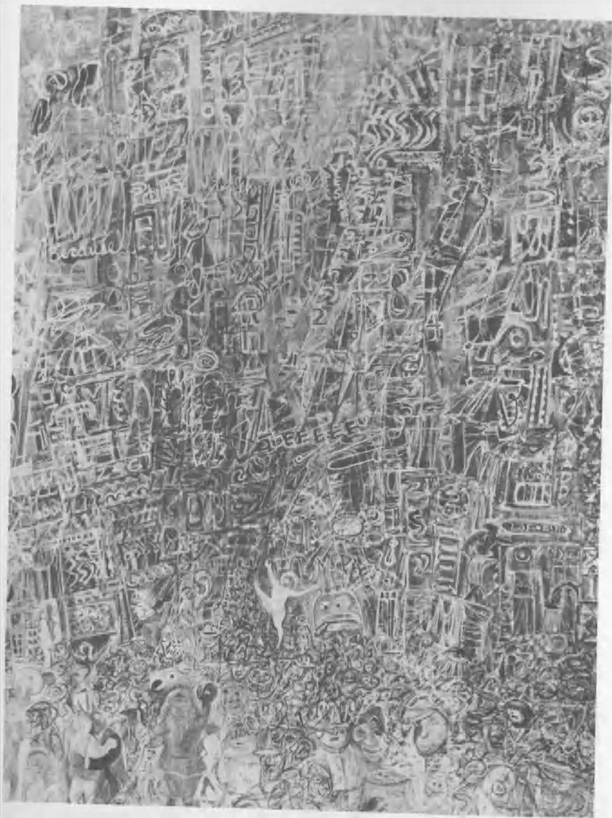
Fig. 2. MARK TOBEY. Broadway Boogie . 1942. Tempera, 30¼ × 23½". Private Collection