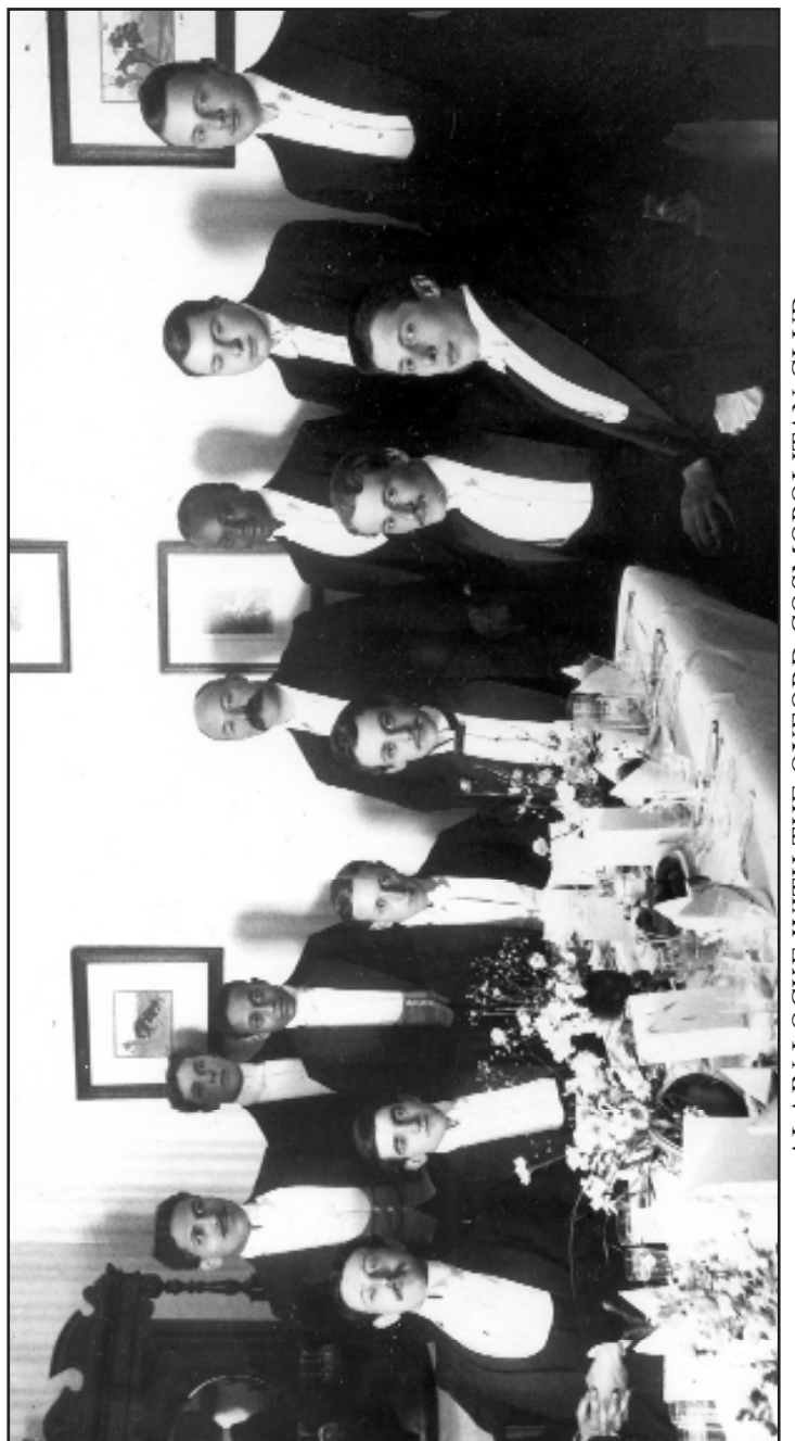
comprised mainly of Oxford University students from Norway, Russia, Scotland, South Africa, and India. ALAIN LOCKE WITH THE OXFORD COSMOPOLITAN CLUB