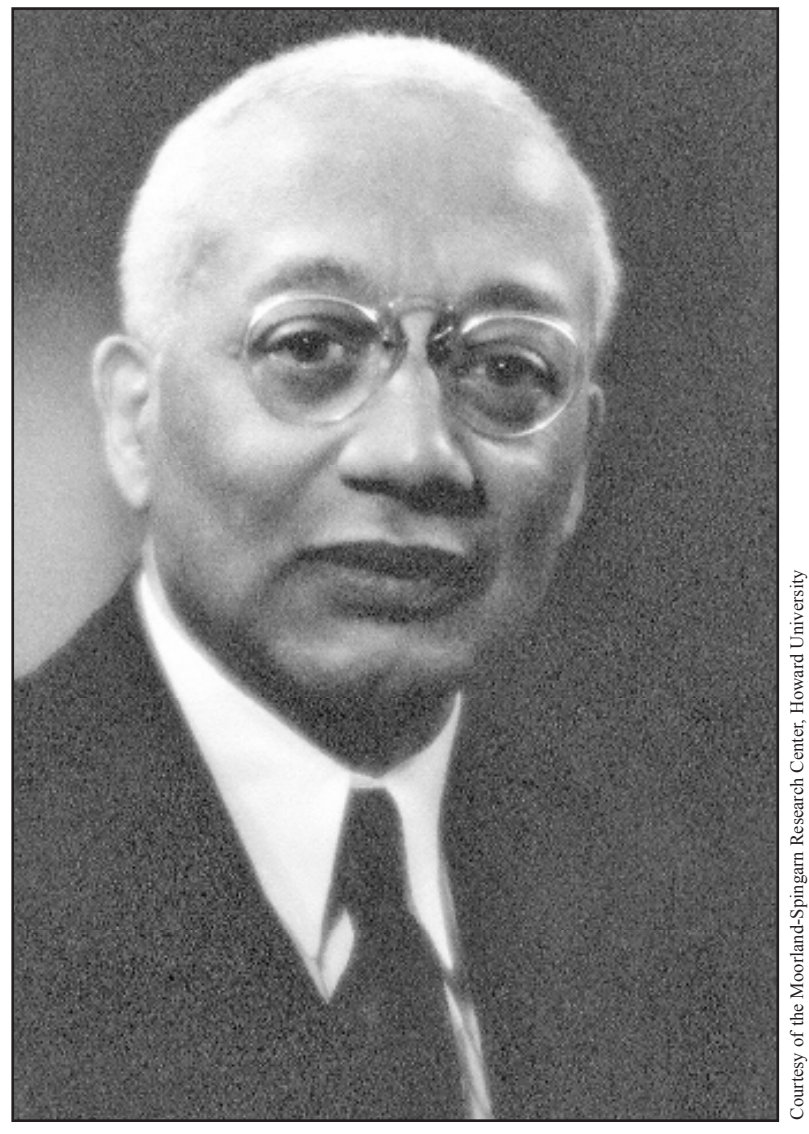
STUDIO PORTRAIT OF ALAIN LOCKE