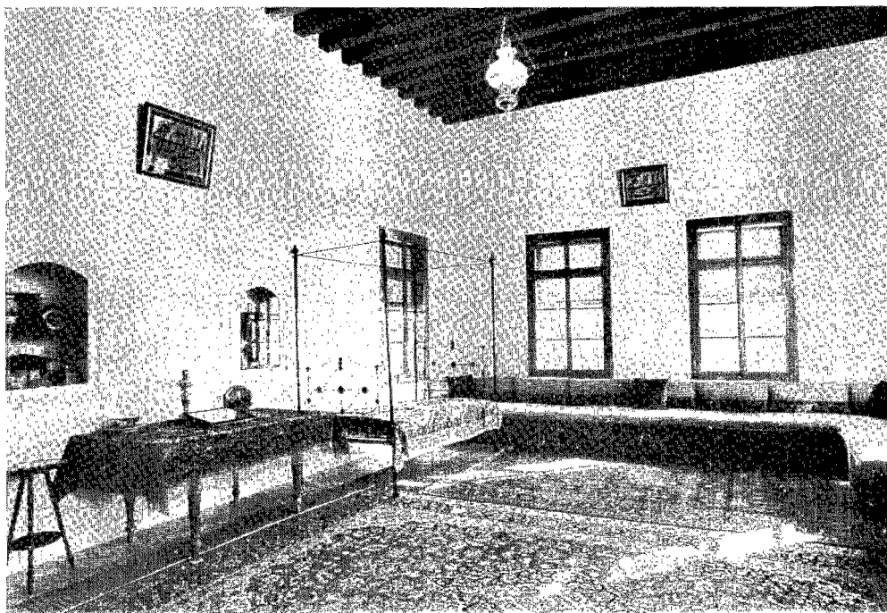
The room in the House of 'Abdu'llah Páshá in which Shoghi Effendi was born in March 1897.