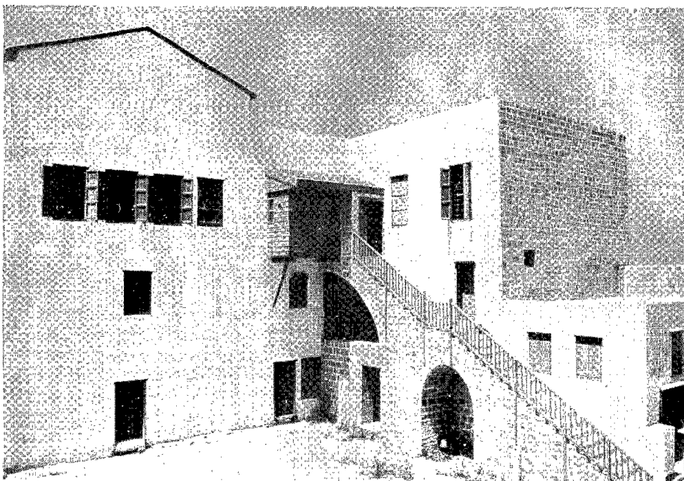
Exterior view of the House of 'Abdu'llah Páshá in its restored condition; 1983.

prophesied, in moving language, the ascendancy which the torchbearer of the Covenant would ultimately achieve over them" . . . It was to this house that the historic first group of pilgrims from the West came to see the Master in the winter of 1898–1899, and in which many more from both East and West sought His presence . . . In this house was born the child ordained to hold the destiny of the Faith in his hands for thirty-six years and to become its "beloved Guardian", the child named "Shoghi" by his Grandfather, who grew up under His loving and solicitous care and became the recipient of His Tablets.'