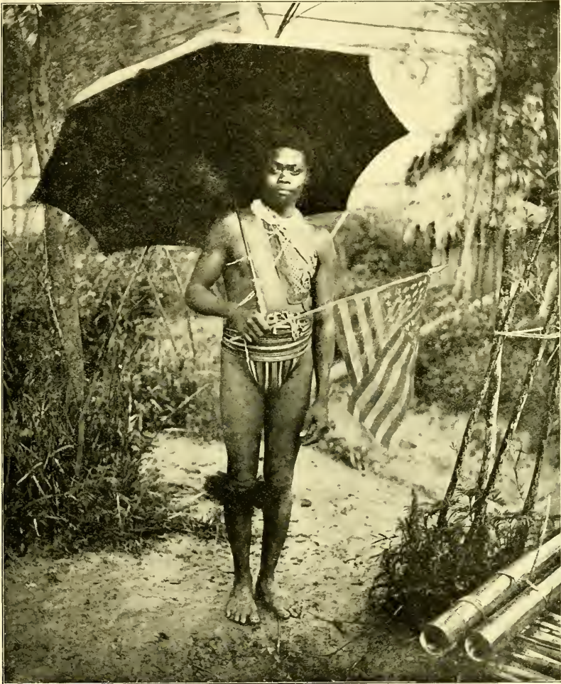
THE SPREAD OF CIVILISATION—THE UMBRELLA.