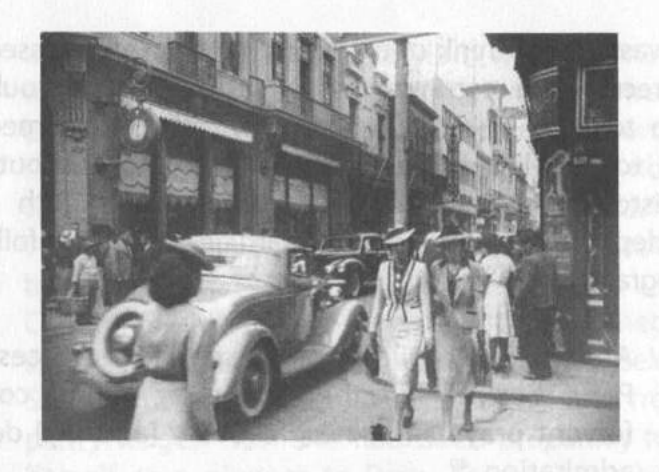
Lima in the 1940s