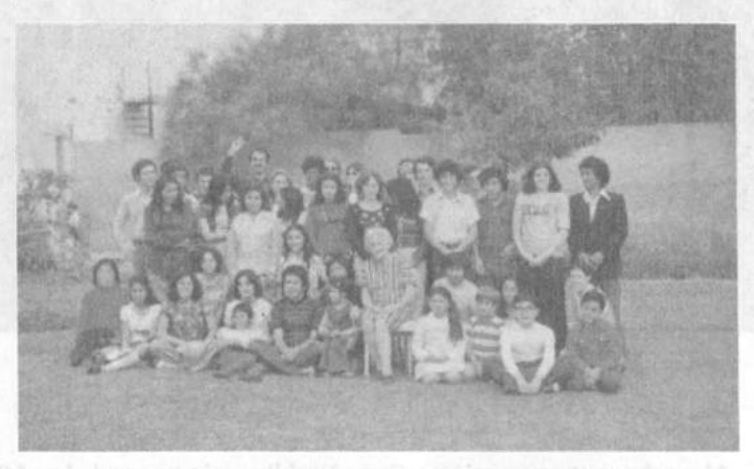
With the Bahá'í youth of Lima, 1975

age and frailty. The Plan goals, as enunciated by the Universal House of Justice, were: "prese vation and consolidation of the victories won; a vast and widespread expansion of the Bahá'í community; development of the distinctive character of Bahá'í life particularly in the local communities". 179