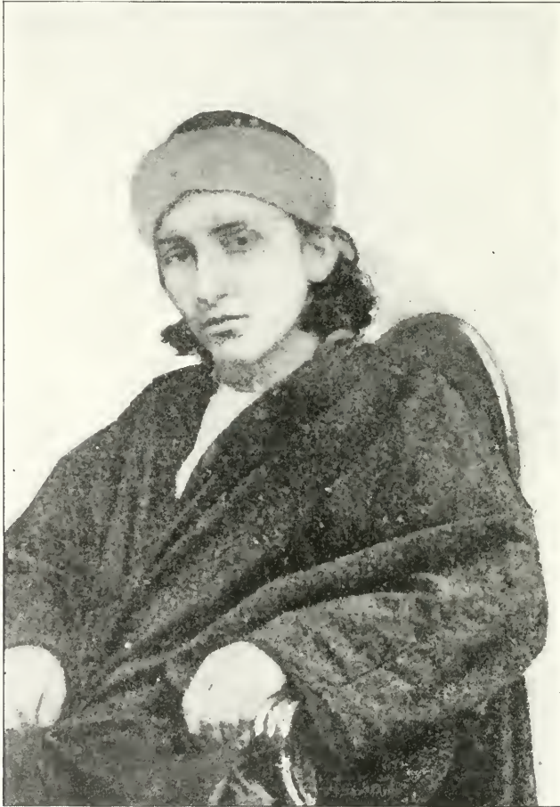
A PREACHER OF BEHAISM.

“He does not permit his family to have luxuries. He himself eats but once a day, and then bread, olives, and cheese suffice him.