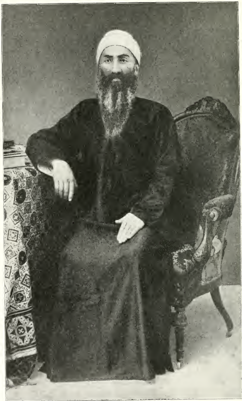
MOUSA EFFENDI, EL KALEEM. THE ELDEST BROTHER OF BEHA ULLAH.* *Mousa means "Moses," and El Kaleem "Speaker With God."