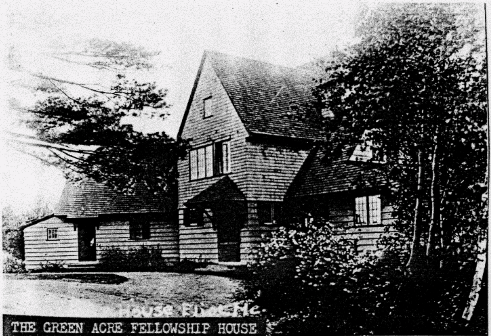
HOUSE Ed. H. H. H. THE GREEN ACRE FELLOWSHIP HOUSE