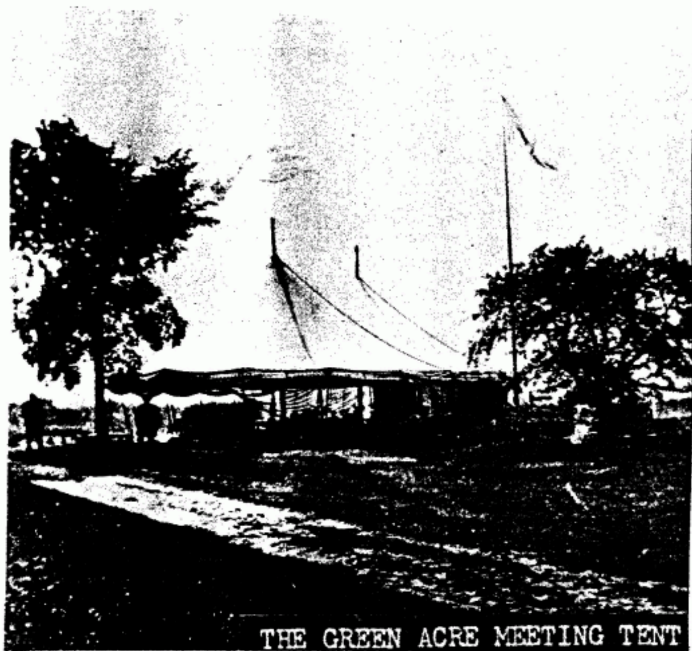
THE GREEN ACRE MEETING TENT