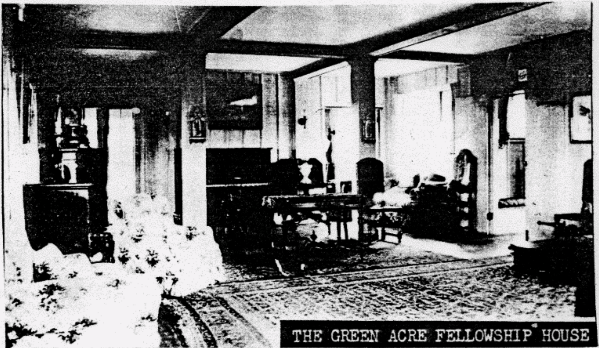
THE GREEN ACRE FELLOWSHIP HOUSE